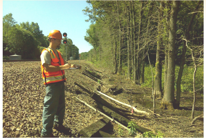
Wetland scientists collected field data on wetlands along the NHHS corridor.

At several locations, work will take place adjacent to historic station buildings. The design and construction of platforms, pedestrian overpasses, and parking facilities at these locations will need to be sensitive to the historic qualities of these stations. This photo shows the existing Windsor station.