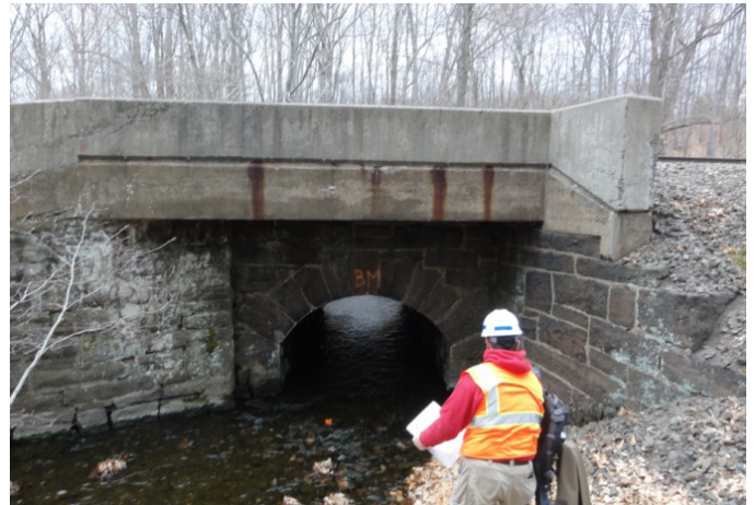
Engineers have conducted field condition surveys of culverts and bridges along the NHHS corridor.