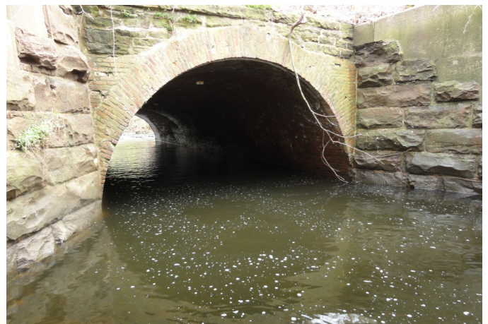
This structure [circa late 1800's] is structurally and hydraulically sound. It will need to be extended to accommodate a second track.