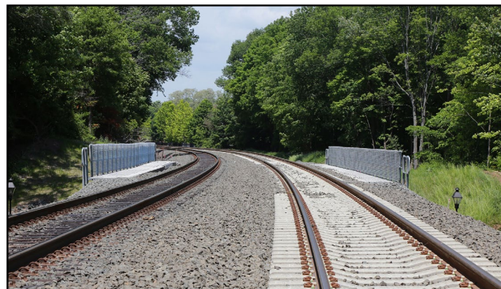
Double track along the rail line in Windsor (May 2018)

Double tracking refers to the addition of a second track along the rail corridor. Double tracking provides increased rail capacity along the corridor and allows trains to pass one another in either direction safely and quickly. The completion of the last segment improves the reliability of rail service north of Hartford and reduces the potential for delays.