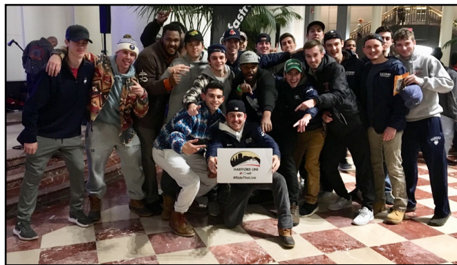
Visitors at the Downtown Hartford "District Night" Pop-Up Block Party (Nov. 2018)

Through social media, the Hartford Line continues to promote local events and encourage business and event patrons along the corridor to use the rail service for their travel, including sporting and entertainment events, fall festivals, and other seasonal activities. The #RideTheLine hashtag on social media continues to feature local success stories of passengers who are taking full advantage of the Hartford Line to live, work, and play in communities along the corridor. Check out some of the photos, and be sure to follow @HartfordLine and @NHHSRail on Facebook, Twitter, and Instagram!