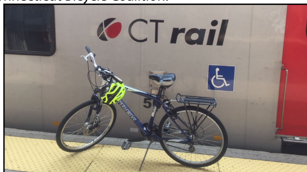
Bikes on trains press event (Aug. 2018)