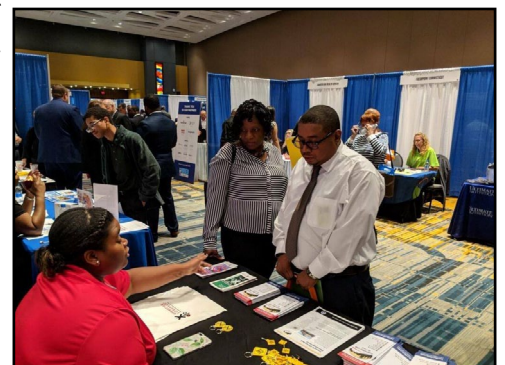
Attendees of the Get Hired Career Expo learn more about Hartford Line service (Sept. 2018)