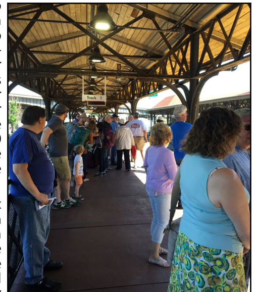
Busy rail boarding platform at Hartford Union Station on opening weekend (June 2018)

CTDOT has also continued to promote Hartford Line service at several local