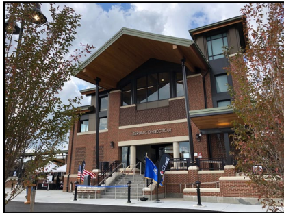
Berlin Station on the day of the ribbon cutting ceremony (Oct. 2018)

Visit the online photo gallery at www.nhhsrail.com/gallery to view all the latest photos.