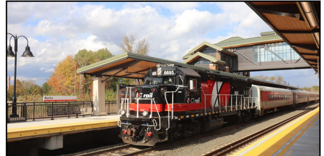
A Hartford Line train pulls into Berlin Station (Oct. 2018)