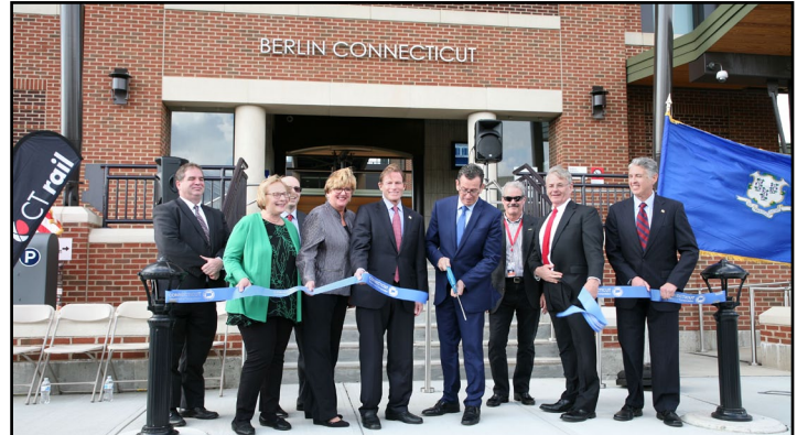
Public officials cut a ribbon at Berlin Station (Oct. 2018)

With construction of the new station in Berlin completed, CTDOT continues the design of several additional new stations that will serve the Hartford Line in the future. Stay tuned for updates in future editions.