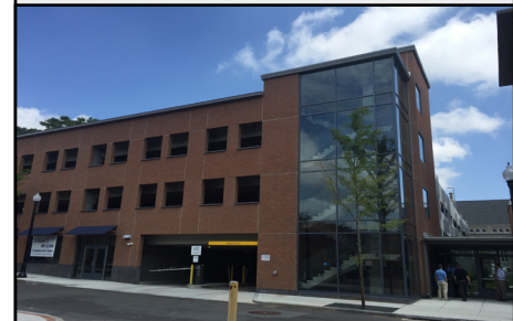
Parking garage near station.